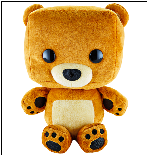
Figure 2: Fisher-Price Smart Toy Bear

The Fisher-Price Smart Toy bear is a Wi-Fi-connected stuffed animal marketed as “an interactive learning friend that talks, listens, and ‘remembers’ what your child says and even responds when spoken to.” 47 The Smart Toy bear app and web services collect a range of consumer information, including: parent email address and login password; child’s first name, birthdate, and gender; toy name and identifier; Wi-Fi password; and mobile device information. The bear itself also gathers information, including images and audio that are stored locally on the toy. 48