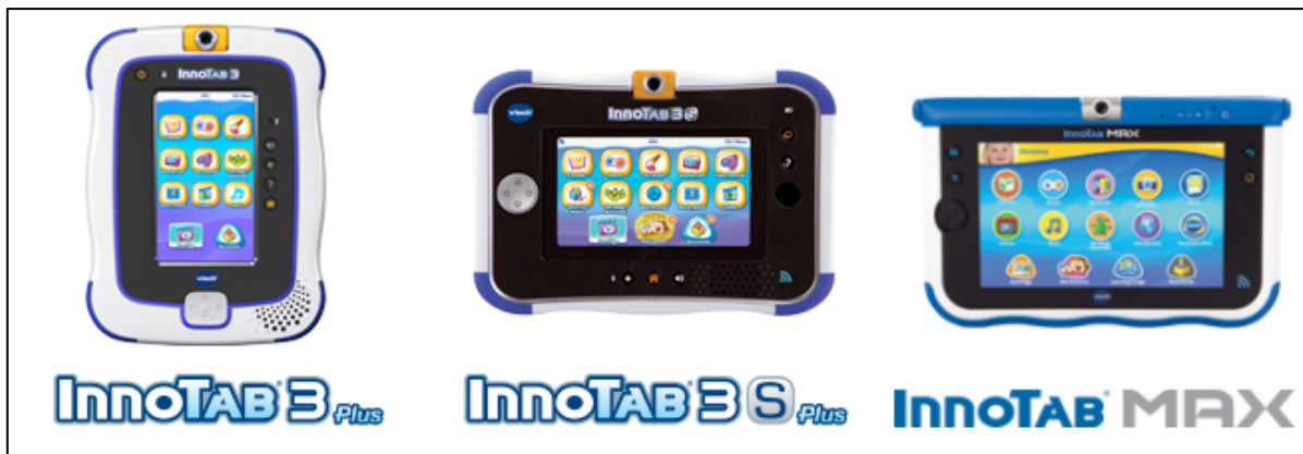
Figure 1: VTech Tablets

This breach exposed VTech’s outdated and inadequate security practices. For example, passwords associated with the millions of email addresses were “hashed” with MD5, an algorithm that scrambled user passwords, but MD5 has been criticized as being weak and “trivial to break.” 38 According to one security expert, “it’s about the next worst thing you do next to no cryptographic protection at all.” 39 VTech also failed to “salt” consumers’ passwords – a common practice of adding random values to passwords to make them more secure – before hashing them. 40 Furthermore, VTech stored password-reset questions in plaintext, meaning a hacker could have used this readily available information to reset passwords to other accounts belonging to VTech users. 41 It was also observed that VTech did not use SSL web encryption, 42 so all communications, including personal information and passwords, were transmitted over unencrypted connections. 43