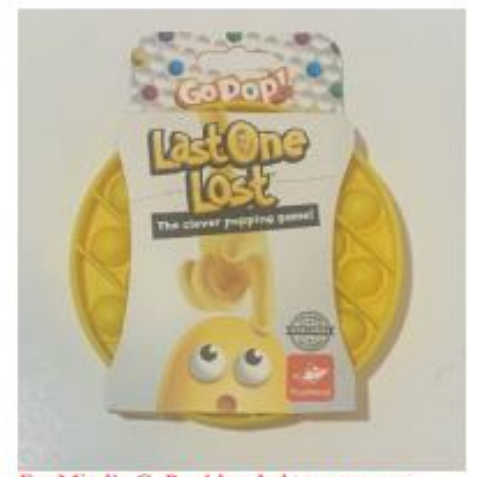
FoxMind's GoPop! has led to numerous knockoff toys.

The GoPop! toy's packaging has a label saying "WARNING: CHOKING HAZARD! Not suitable for children under 3 years." PIRG toy researchers found a listing called 2 Packs Pop Fidget Sensory Toys that does not include an age warning on the listing or the packaging.37