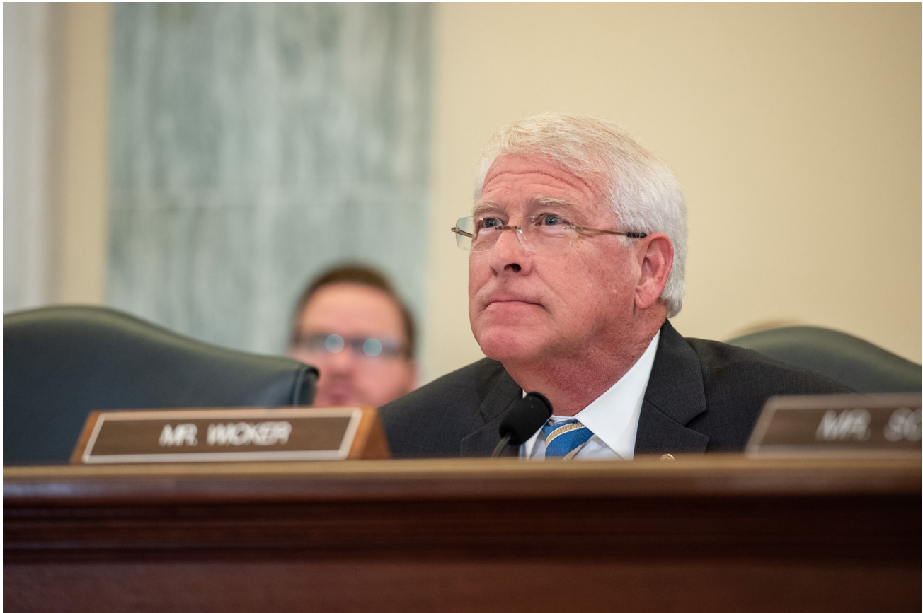
Sen. Roger Wicker (R-Miss.), chairman of the Subcommittee on Communications, Technology, Innovation, and the Internet, at a hearing in July 2018.