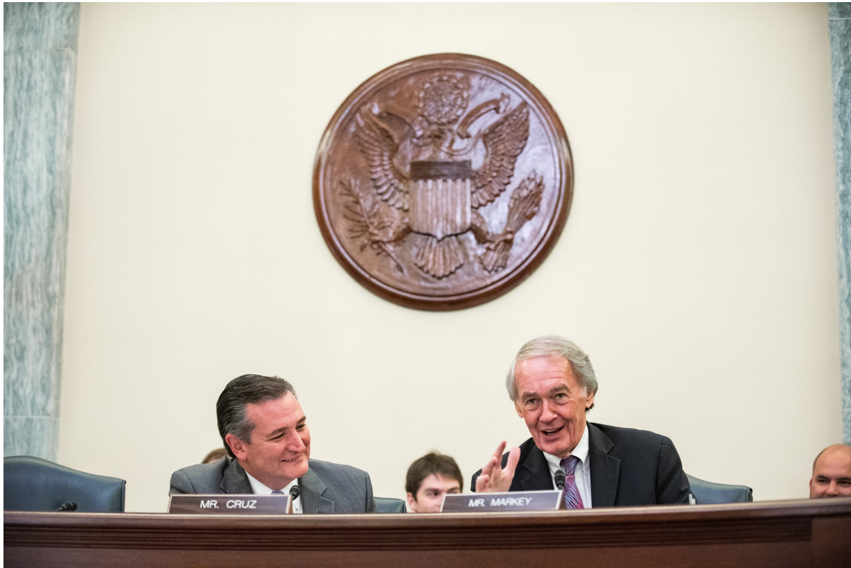
Sens. Ted Cruz (R-Texas) and Ed Markey (D-Mass.), chairman and ranking member of the Subcommittee on Space, Science and Competitiveness, at a September 2018 hearing.