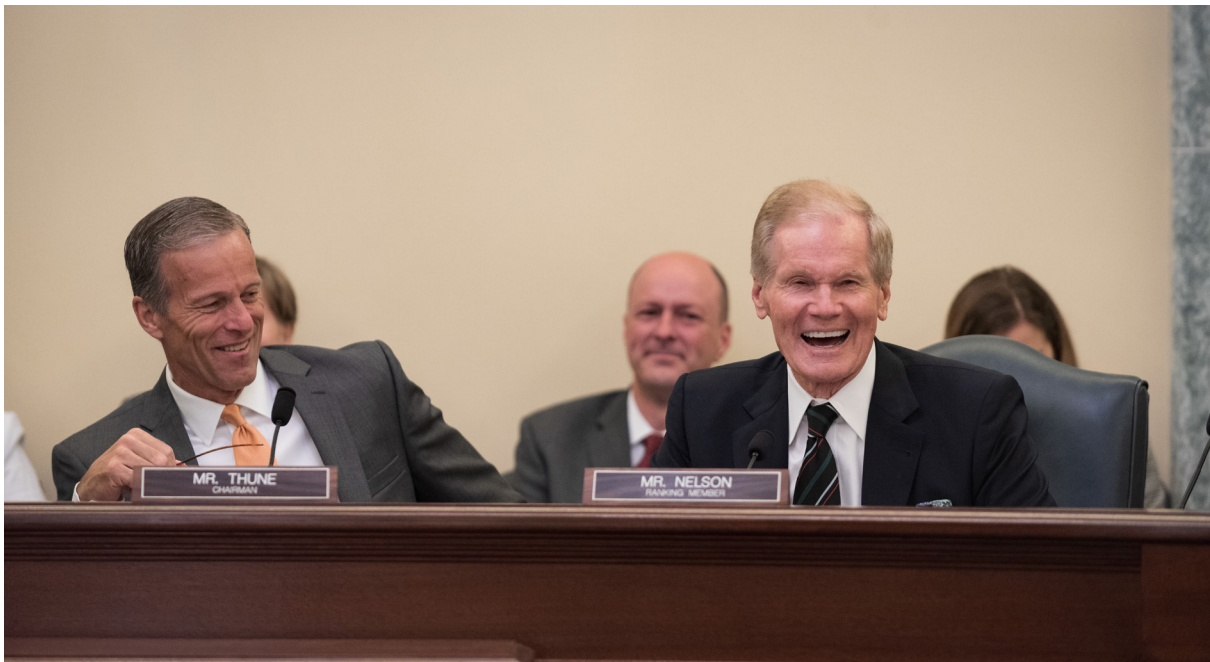
Chairman Thune (R-S.D.) and Ranking Member Nelson (D-Fla.) at a July 2018 Sharks! hearing.