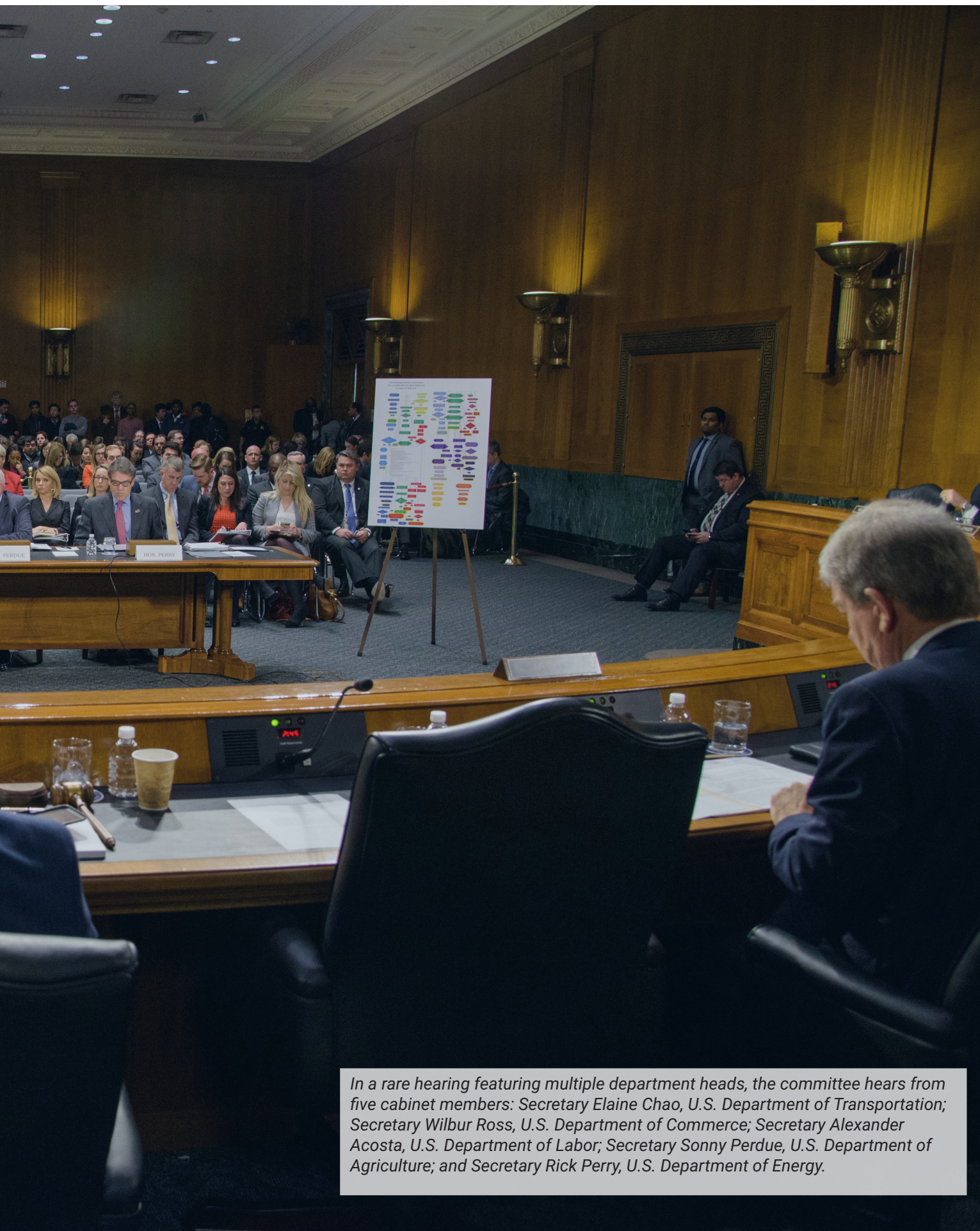
In a rare hearing featuring multiple department heads, the committee hears from five cabinet members: Secretary Elaine Chao, U.S. Department of Transportation; Secretary Wilbur Ross, U.S. Department of Commerce; Secretary Alexander Acosta, U.S. Department of Labor; Secretary Sonny Perdue, U.S. Department of Agriculture; and Secretary Rick Perry, U.S. Department of Energy.