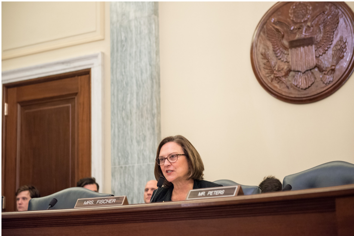
Sen. Deb Fischer (R-Neb.), chairman of the Subcommittee on Surface Transportation and Merchant Marine Infrastructure, Safety and Security, at a subcommittee hearing.