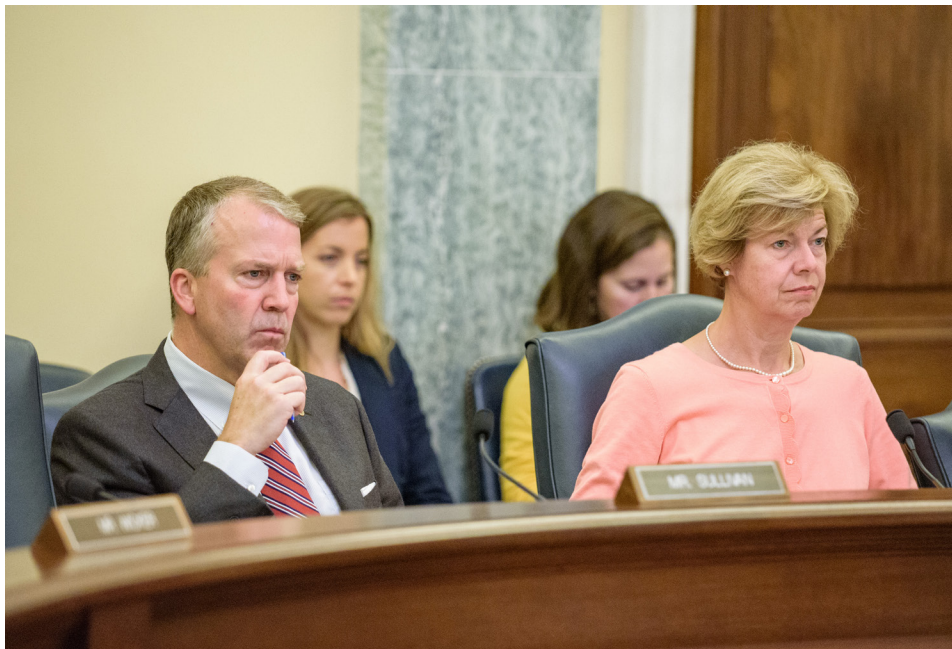
Sens. Dan Sullivan (R-Alaska) and Tammy Baldwin (D-Wash.), chairman and ranking member of the Subcommittee on Oceans, Atmosphere, Fisheries, and Coast Guard, at a July 2018 hearing on NOAA's Blue Economy Initiative.