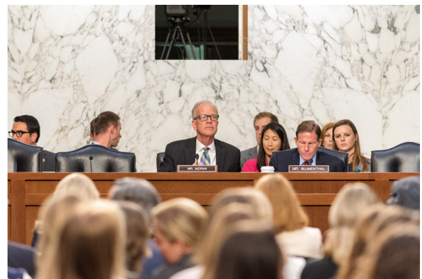
Subcommittee Chairman Jerry Moran (R-Kan.) and Ranking Member Richard Blumenthal (D-Conn.) lead a hearing on the Nassar scandal.

Examining systemic failures that allowed former USA Gymnastics and Michigan State University doctor Larry Nassar to abuse young victims for years, a Commerce subcommittee surfaced answers aimed at stopping it from happening again. In 2018, President Trump signed committee legislation setting up an independent, non-conflicted entity for amateur athletes to report abuse.