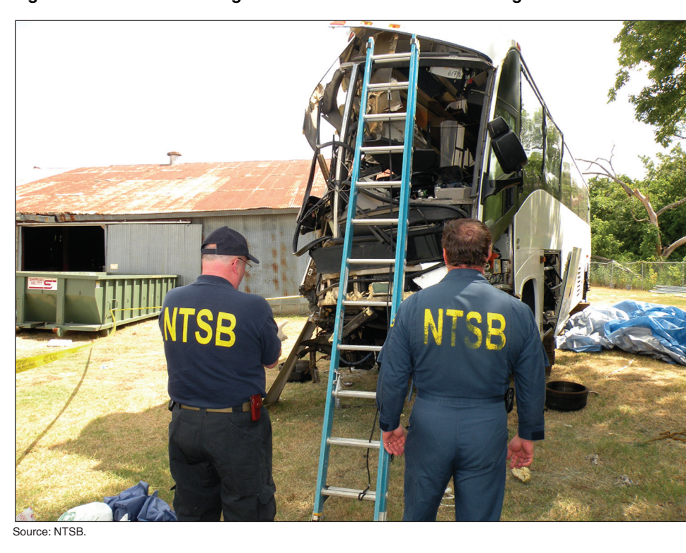
Figure 4: Two NTSB Investigators Assess Motorcoach Wreckage

The remaining three recommendations have not yet been fully implemented. However, NTSB has initiated actions that could lead to closure of the recommendations. NTSB is deploying an agencywide electronic information system based on Microsoft SharePoint that will streamline and increase NTSB's use of technology in closing out its recommendations and in developing reports. When fully implemented, this system should serve to close these two recommendations.