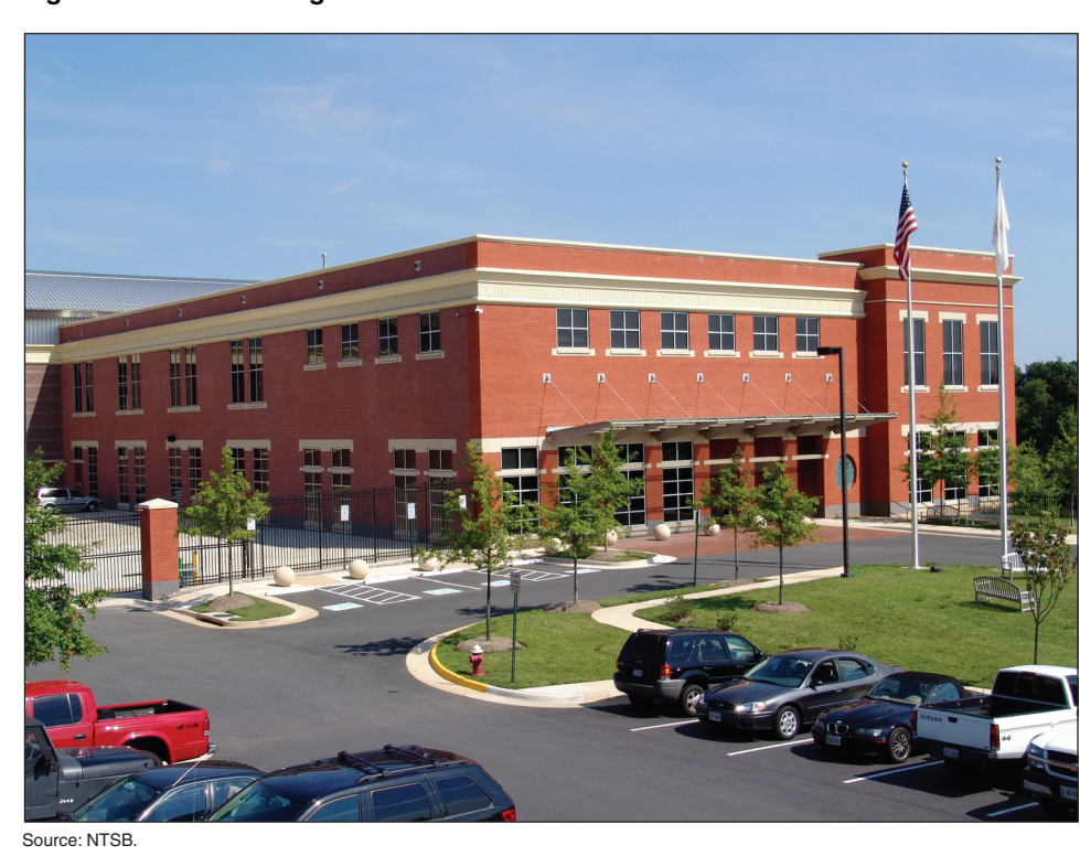
Figure 6: NTSB Training Center

NTSB has fully implemented our recommendation to increase use of the Training Center. NTSB subleased all available office space at its Training Center to the Federal Air Marshal Service (a DHS agency) at an annual fee of $479,000. NTSB also increased use of the Training Center's classroom space and thereby increased the revenues it receives from course fees and rents for classroom and conference space. From fiscal year 2006 through fiscal year 2009, NTSB increased other agencies' and its own use of classroom space from 10 to 80 percent, and increased revenues by over $1.1 million. For example, according to NTSB it has a sublease agreement with DHS to rent approximately one-third of the classroom space. NTSB considered moving certain staff from headquarters to the Training Center, but halted these considerations after subleasing all of the Training Center's available office space. NTSB decreased personnel expenses related to the Training Center from about $980,000 in fiscal year 2005 to $507,000 in fiscal year 2009 by reducing the center's full-time equivalent positions from 8.5 to 3.0 over the same period. As a result of these efforts, from fiscal year 2005 through fiscal year 2009, Training Center revenues increased 179 percent while the center's overall deficit decreased by 51 percent. (Table 2