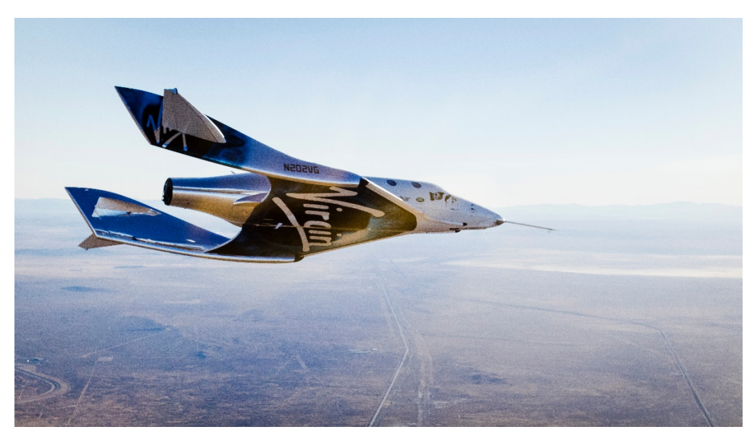
Figure 2: SpaceShipTwo, VSS Unity manufactured by The Spaceship Company

The current SpaceShipTwo, named the VSS Unity , is currently undergoing flight test, and was manufactured in Mojave, California by Virgin Galactic's manufacturing wing, The Spaceship Company. Commercial operations will be based in New Mexico at Spaceport America, the world's first purpose-built commercial spaceport.