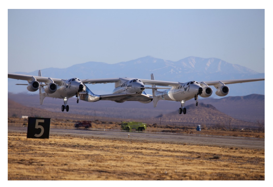
Figure 3: WhiteKnightTwo and SpaceShipTwo in their mated configuration during a test flight in March 2017