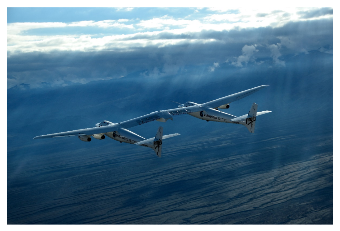
Figure 1: WhiteKnightTwo Carrier Aircraft, VMS EVE