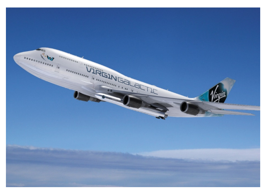
Figure 5: Modified Boeing 787-400 carrying the LauncherOne rocket

Currently, Virgin Orbit is working towards initial test flights of the LauncherOne system. Virgin Orbit will operate LauncherOne under a FAA AST license and will initially launch from Mojave Air & Space Port, but will eventually operate from other licensed sites.