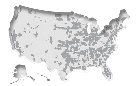
4G 24 months after first launch