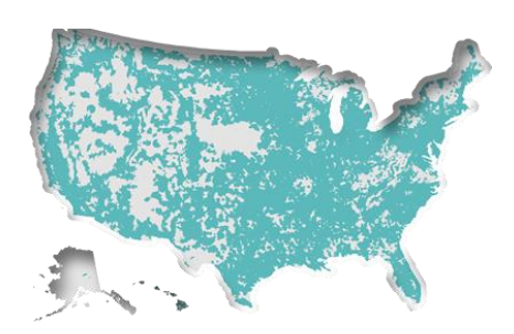
5G 22 months after first launch